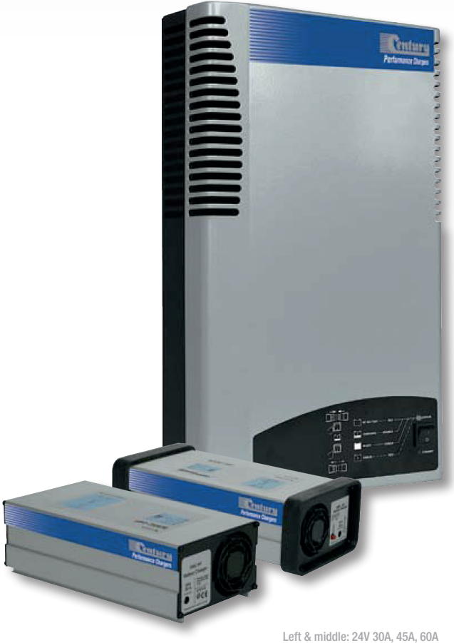
Right: 24V120A, all 36V, 48V & 80V