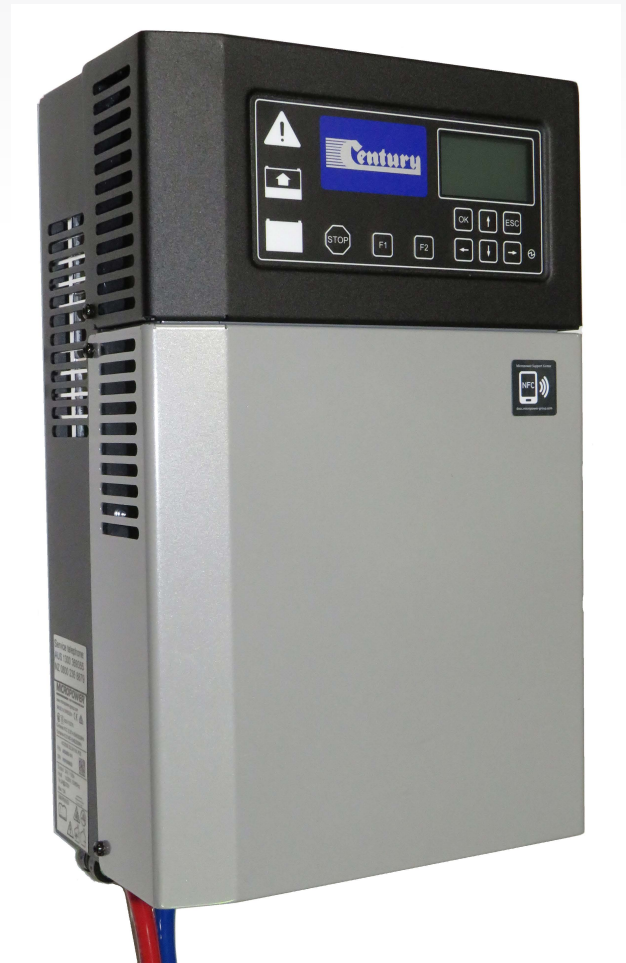
Products shown above: 36V 150A, 48V 130A & 80V 80A